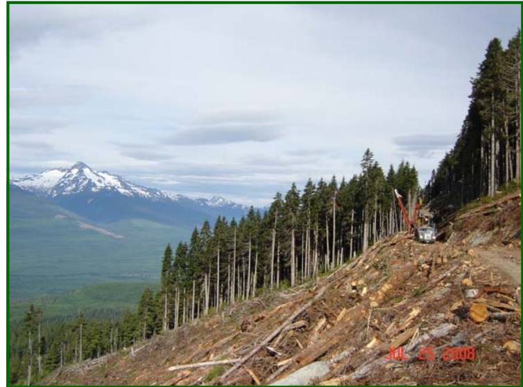
Clear Creek North Logging Block

Further silviculture surveys are scheduled for the fall of 2008 which will drive silviculture operations in 2009.