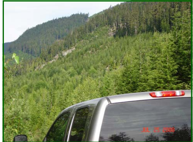
Little Cedar North Spacing Block