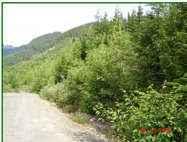
Tree Spacing in Little Cedar North