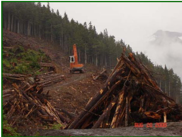
Swanson Creek Block