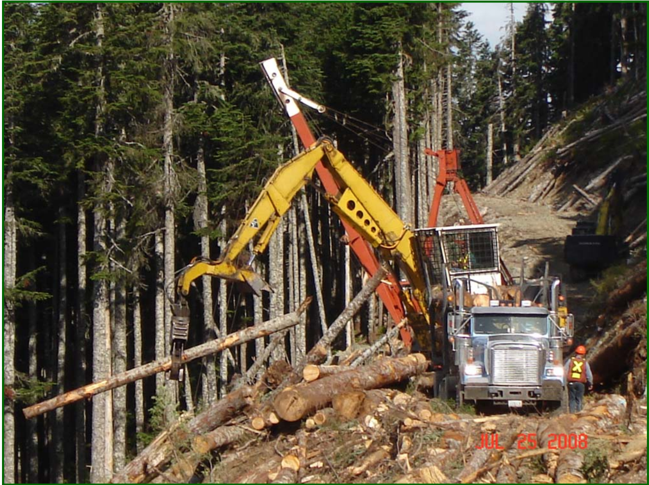
Clear Creek North Block

creating profit and capacity with employment and entrepreneurship opportunities for Kitsumkalum people