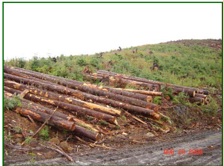
Decked Wood at Swanson Creek