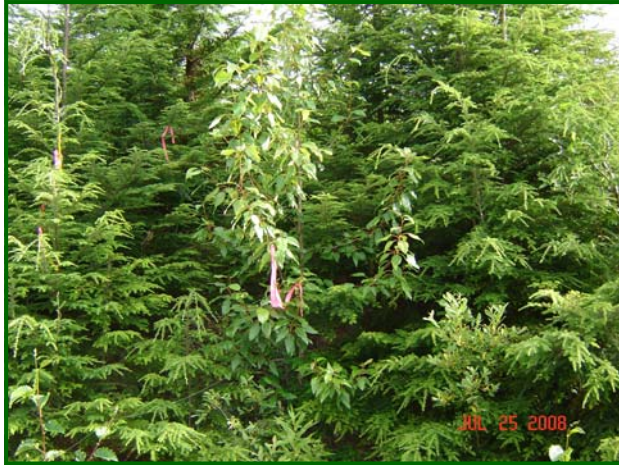
Little Cedar North